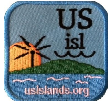
US Islands Patch

Members can come up and try out Yaesu's new FT-891 and Diamond's new HFV5 antenna on the island. The W/VE QSO party is open to all club members. We will give out US Island patches to members who make island contacts this year from our club station.