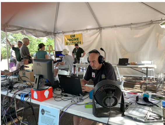
A scene from the Big Tent during Field Day 2019. Field Day 2020 will look very different!