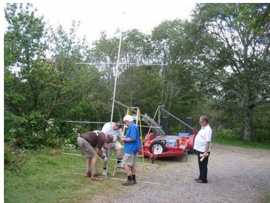
Some of the FourLanders team members assembling the two, 5 element 6m beams prior to cranking them

On the way up, a large caravan formed and we all kept in contact with our 2m radios reporting traffic conditions (an accident and some road construction) as well as on the spot directions to get us to a gas/rest stop, and to the mountain. On arrival Friday afternoon, we met in a small town called Maggie Valley at the base of the mountain at a Subway to fuel up and get ready for the fun.