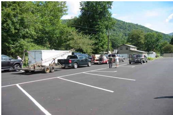
Trailer caravan outside Subway in Maggie Valley, NC. Not too many places to hold all seven trailers!

The participants pull trailers (some with crank up antenna masts) and 2 operating and 1 storage trailer as well as a 15 Kilowatt generator. Imagine all the comforts of home at a primitive campground site. (We even had an antenna to create a hot spot so we had internet in the operating trailers to access chat groups, spotting networks, etc.) Some pulled campers, some pitched tents, one in a motel, and some just slept in their vehicle.