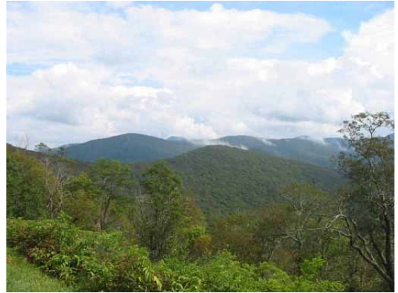
Blue Ridge Mountains from Mile High Campground, the W4NH contest Site

The campground is at the top of a mountain over 5440+ feet high. The views were spectacular! The weather was good and bad, some rain, hot and cold, sometimes perfect, and the food provided was fantastic (W4NH = Whiskey Four Never Hungry)!